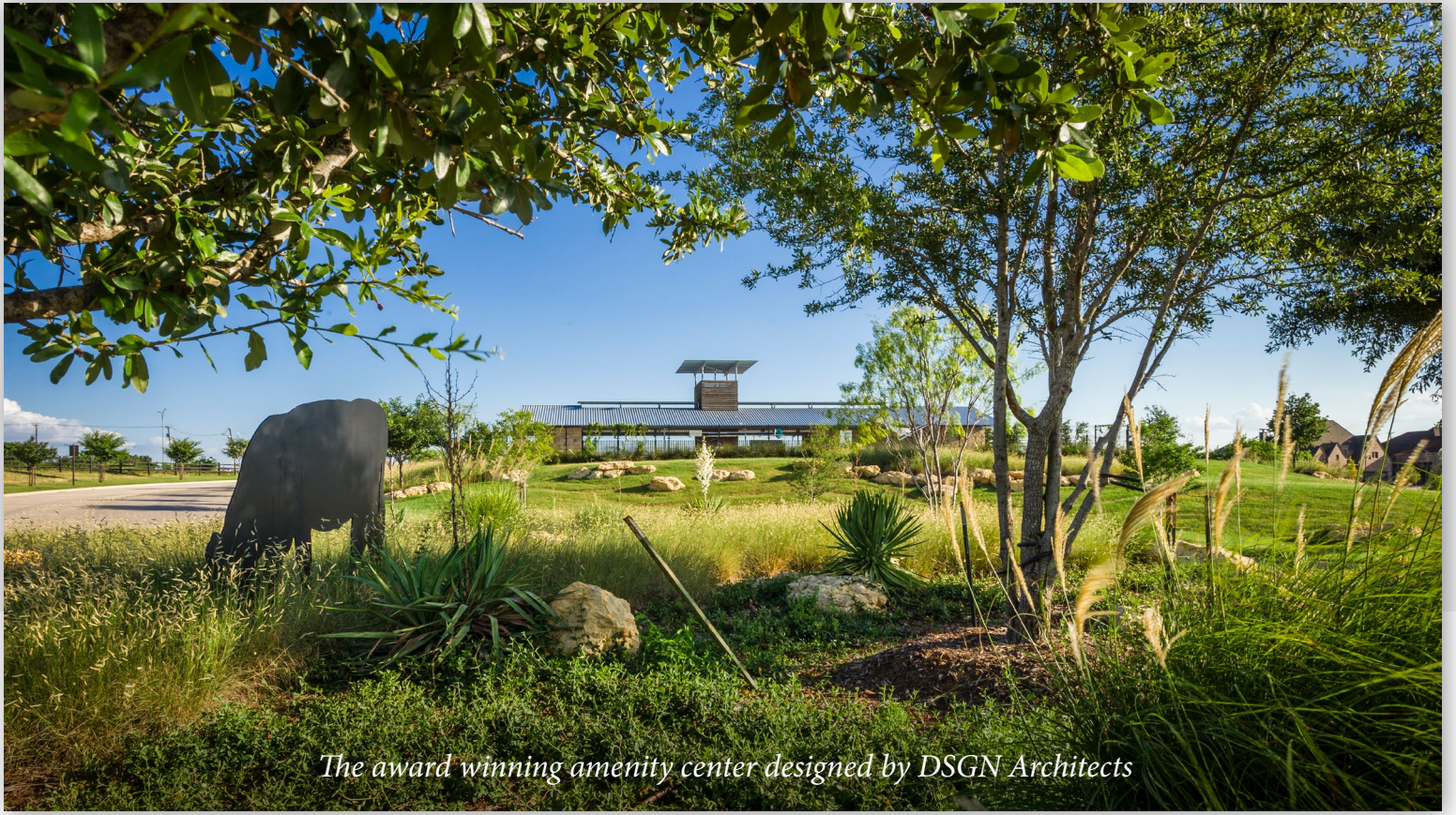
The award winning amenity center designed by DSGN Architects

In 2010, the Estate of Byron Nelson selected Wilbow Corporation to develop a portion of the ranch into Byron’s vision of a vibrant community of homes where young, growing families could live and thrive. The community has four distinctive neighborhoods all under strict architectural covenants. Winding streets follow the rugged contours and native plantings create a unique and memorable setting for executive homes. The community incorporates an on-site daycare center and Wayne A. Cox Elementary School, as well as an award-winning amenity center and acres of open space.