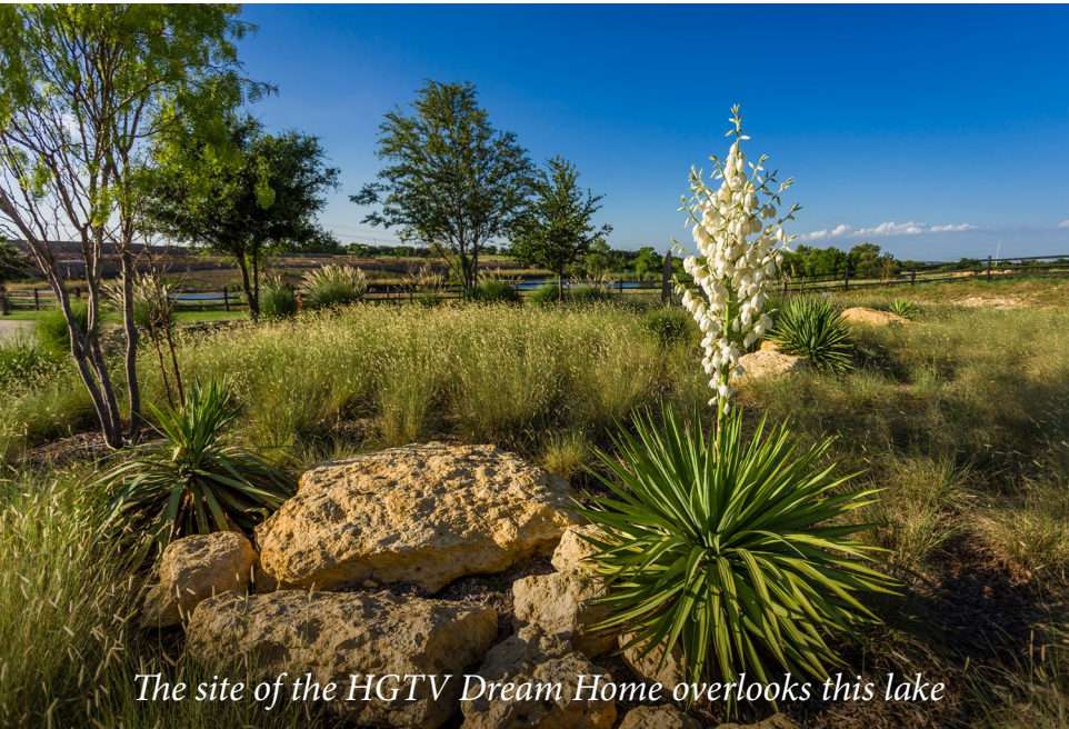
The site of the HGTV Dream Home overlooks this lake

In 2010, the Estate of Byron Nelson selected Wilbow Corporation to develop a portion of the ranch into Byron’s vision of a vibrant community of homes where young, growing families could live and thrive. The community has four distinctive neighborhoods all under strict architectural covenants. Winding streets follow the rugged contours and native plantings create a unique and memorable setting for executive homes. The community incorporates an on-site daycare center and Wayne A. Cox Elementary School, as well as an award-winning amenity center and acres of open space.